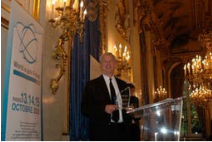
General Counsel, New Pavilion; Senior Counselor, American Blockchain PAC; coauthor, Redefining the Future of the Economy